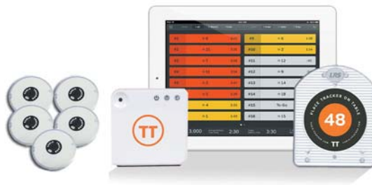
Table Tracker Pro

At Jason's Deli, Table Tracker hasn't just made delivering food easier, its made it faster. The implementation has produced immediate improvement, reducing ticket times by a full minute. Instead of searching for guests, food runners know exactly where customers are sitting so they can deliver food immediately. Table Tracker also helps Jason's Deli collect important information about its food delivery times. Using Table Tracker's reporting tools, Jason's Deli store managers and corporate employees can identify trends and pinpoint opportunities for improvement.