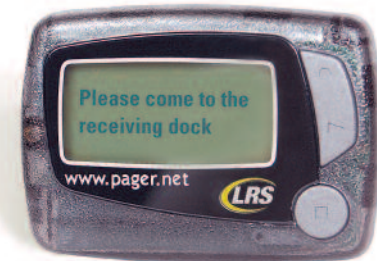
Battery-Operated Alphanumeric Pager