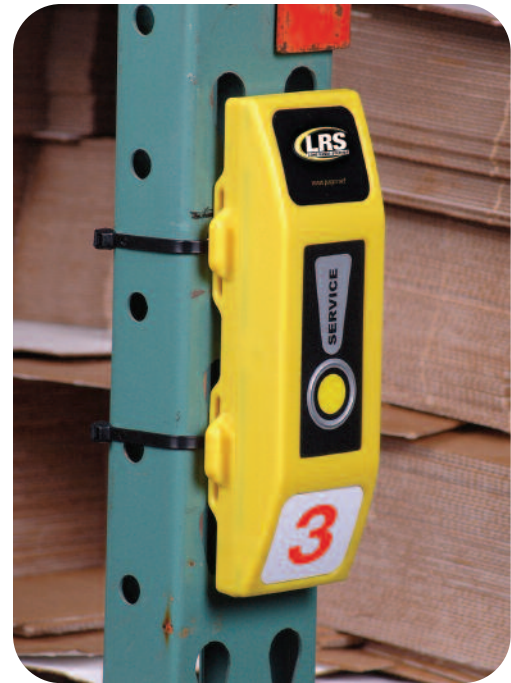
Butler XP mounted with zip ties