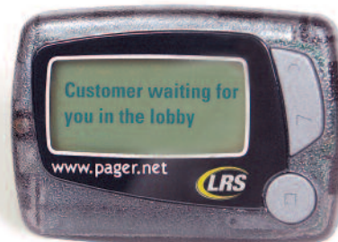
Battery-Operated Alphanumeric Pager

Maintaining constant contact between manufacturing employees can be a daily challenge. Improve efficiency and productivity in manufacturing operations by equipping managers, supervisors, technicians, and other key personnel with the tools to communicate instantly and effectively, no matter where they are onsite.