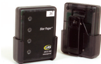
Nursery & Daycare Pagers Nine models to choose from

Butler II can also be used for staff-to-staff paging. Mount it at the front desk so the receptionist can call for the manager, trainers, massage therapists or other staff members when an appointment arrives.