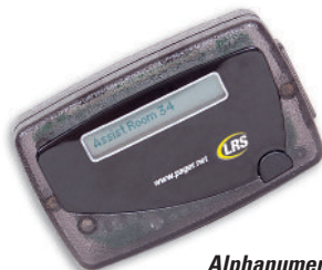
Alphanumeric Pager Two models to choose from