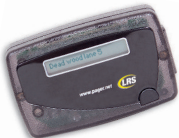
Rechargeable Alphanumeric Pager