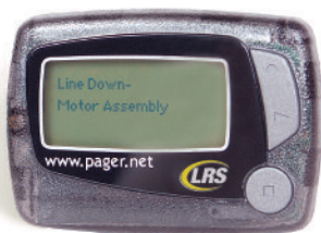
Battery-Operated Alphanumeric Pager