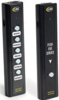
Butler II Pushbutton Paging Transmitter