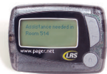
LRS Alphanumeric Staff Pager