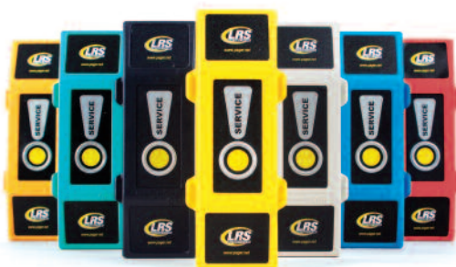
Colors Available: Yellow, Black, Bone, Blue, Coral, Coastal Green, Mango Orange

Beach Butler works with both LRS Alphanumeric pagers.