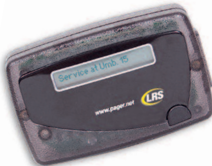
1-Line Rechargeable Alphanumeric