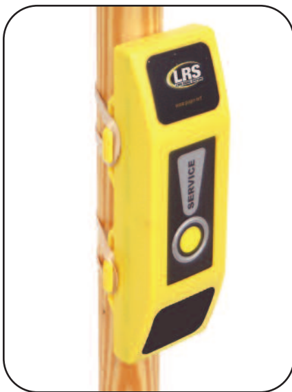
Beach Butler can also be mounted with rubber bands, Velcro strips or optional umbrella clip.