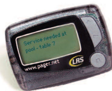
4-Line Battery-Operated Alphanumeric